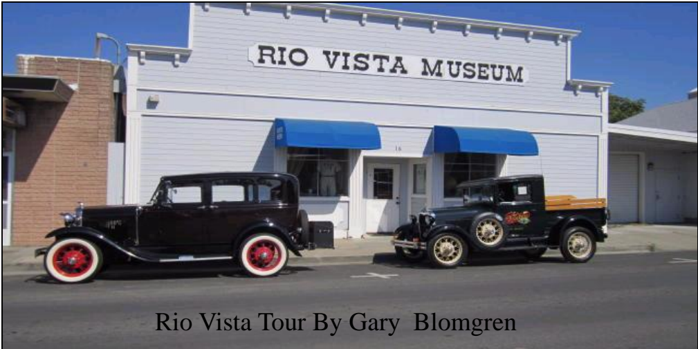
Rio Vista Tour By Gary Blomgren