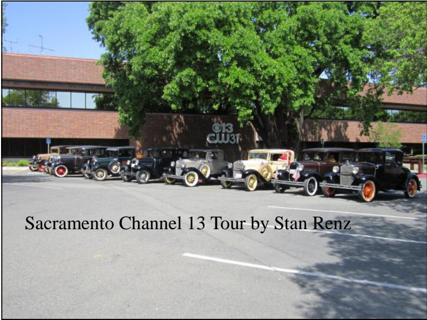
Sacramento Channel 13 Tour by Stan Renz