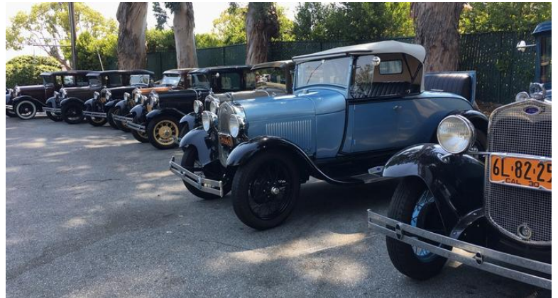
The line of A's at our annual picnic